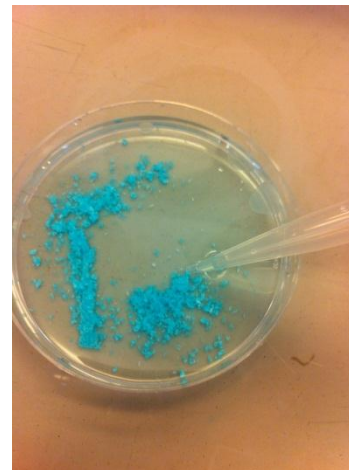
Figures 2 and 3. From left to right, the proper (l) and improper (r) way to take a sample.