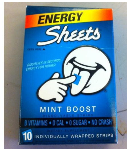
Figure 1. The energy strips you will be using in class.

With dissolvable strips, the delivery vehicle is a thin, flexible sheet of polymer. The active pharmaceutical ingredient (API) is incorporated into this polymer to form the final product. Depending on the nature of the medicine, the API can be incorporated in one